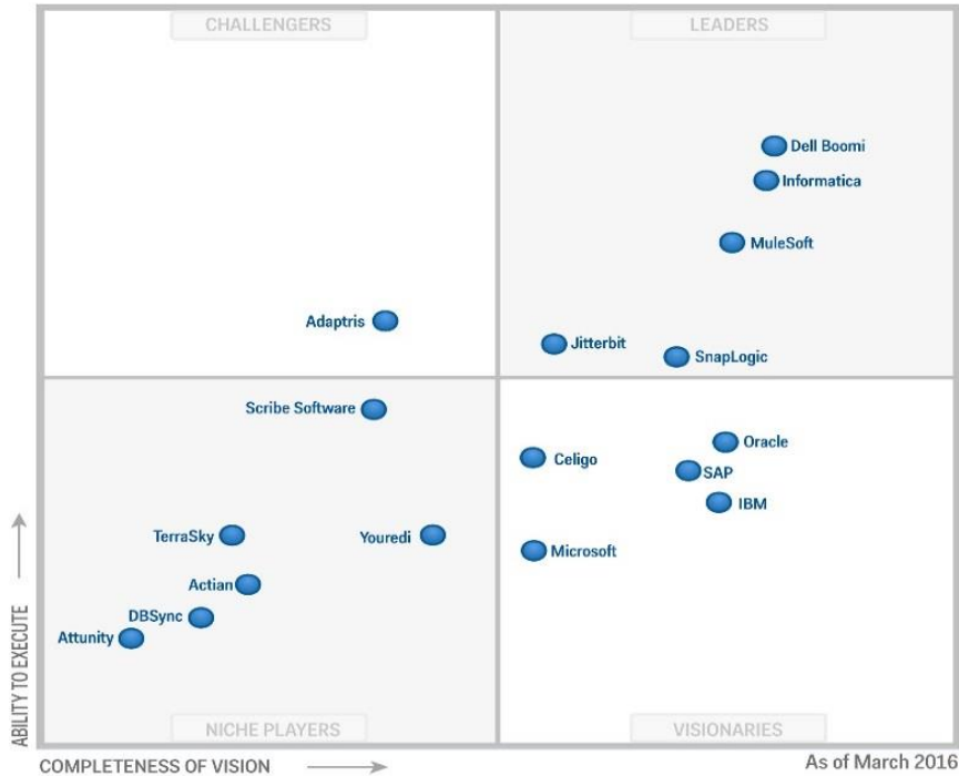
Figure 1. Magic Quadrant for Enterprise Integration Platform as a Service, Worldwide